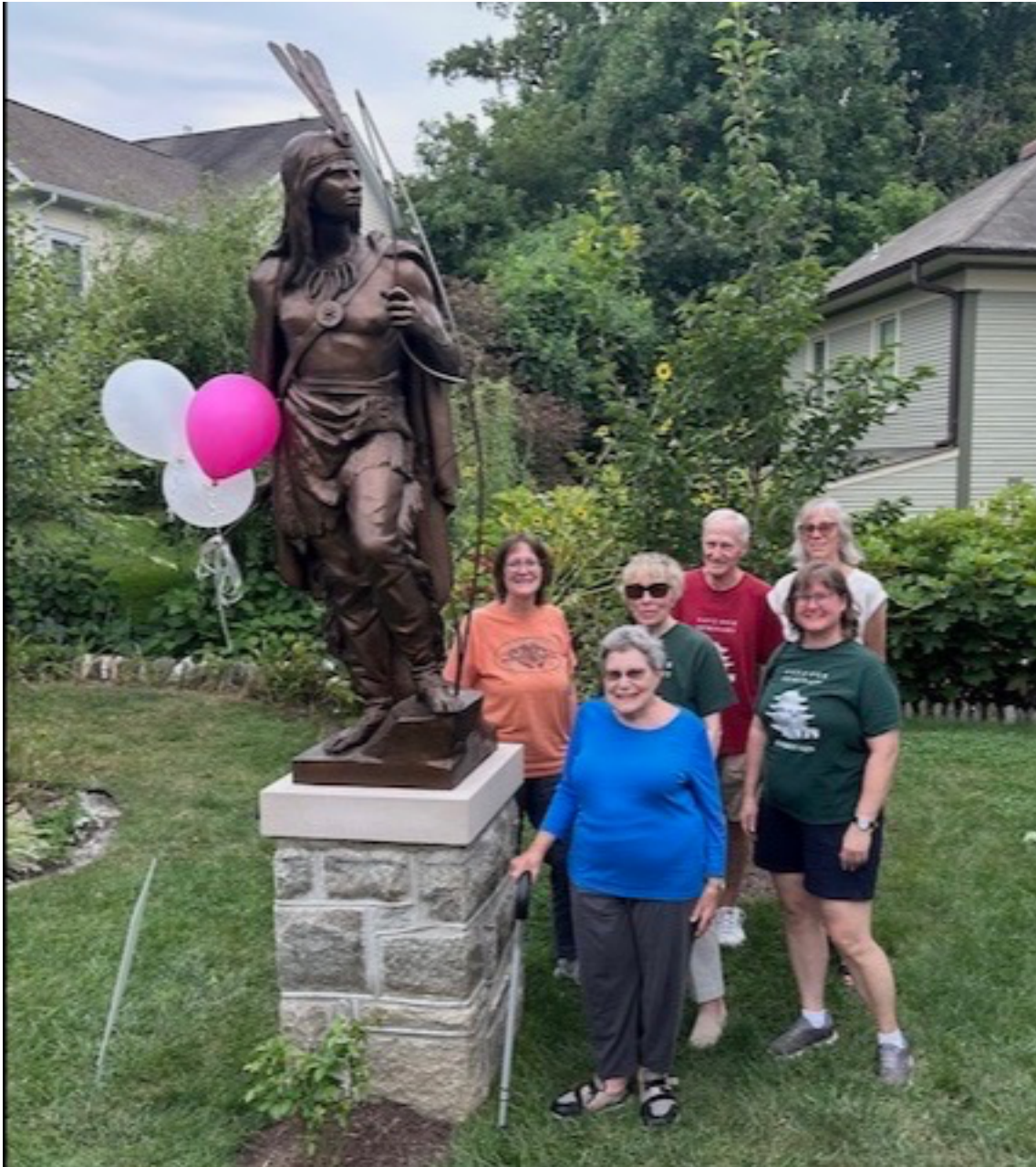
SOS Sculpture Committee at celebration of Hiawatha restoration

We began our dedicated fundraising efforts in 2018 to come up with the estimated $26,000 in costs to transform Hiawatha from primer yellow back to the original bronze paint finish and to reconstruct his damaged bow and missing arrow. The work also included raising and repointing the stone base, which had sunk substantially into the ground, and installing a new concrete plinth for him to stand on.