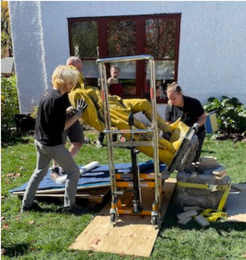
Hiawatha being removed from pedestal