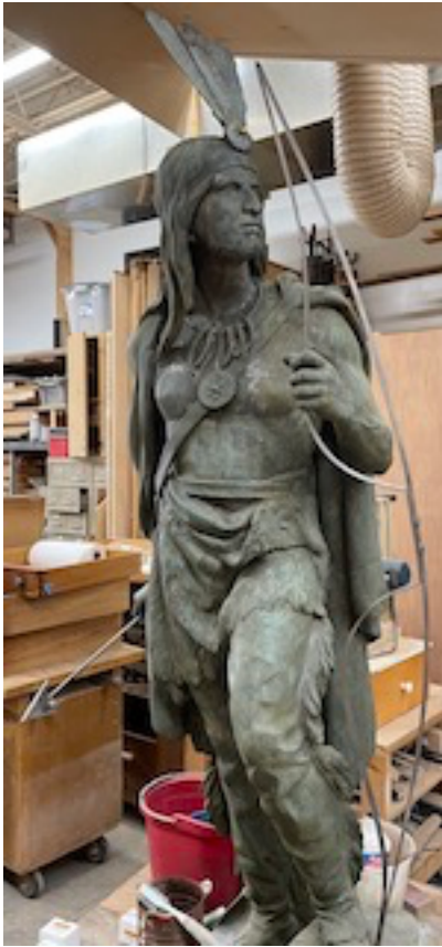
Hiawatha stripped of old primer

Our beloved statue is now back home and ready to weather the next 100 years thanks to the generous support of SOS members and donors!